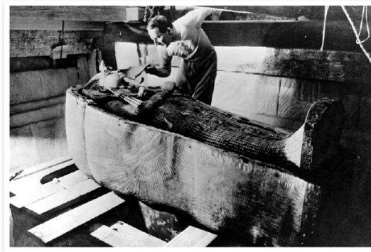
Howard Carter examining the tomb of Tutankhamun

A wealthy Englishman, Lord Carnarvon, was interested in ancient Egypt. He paid for an archaeologist called Howard Carter and a team of workers to carry out excavations in the Valley of the Kings on the west bank of the Nile, where they discovered Tutankhamun's tomb. It took Carter and his team 10 years to remove over 3000 items from the tomb. After the discovery, a series of strange events occurred, including the death of Lord Carnarvon. Many people believed a curse had been placed on Carter's team for disturbing the tomb.