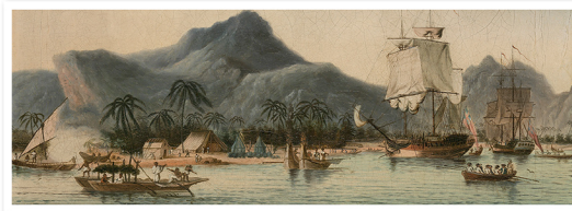
HMS Resolution and HMS Discovery

In 1776, Captain Cook went on his final voyage. He sailed on the HMS Resolution again and the HMS Discovery travelled with him. He was looking for a route between the Atlantic and Pacific Oceans. He visited the Hawaiian Islands, where he was killed.