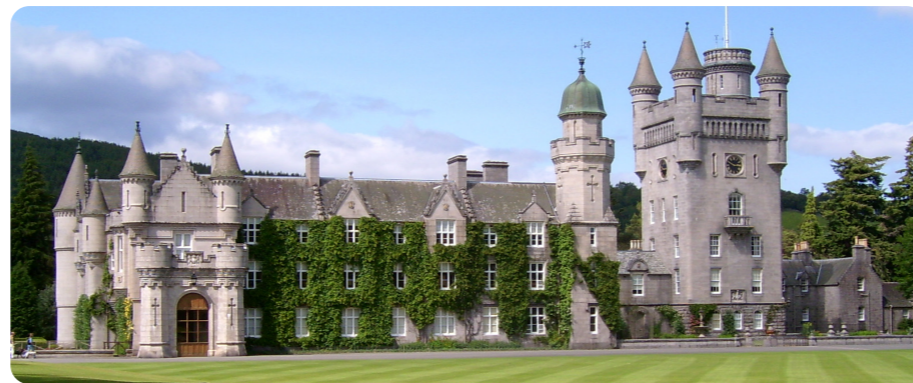
Balmoral Castle is in Aberdeenshire, Scotland. It is used mainly as a holiday home for the Royal Family.