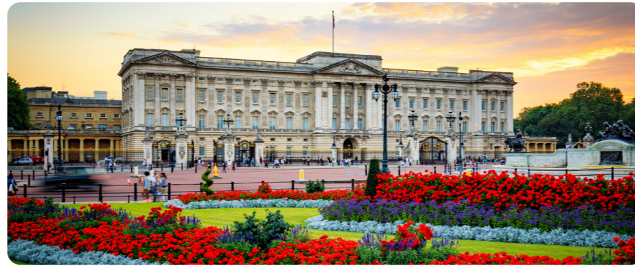
Buckingham Palace is in London, England. It is the Queen's main residence.

Royal residences include palaces, castles and stately homes. Some of them are used for official royal business and some are used as holiday or private homes.