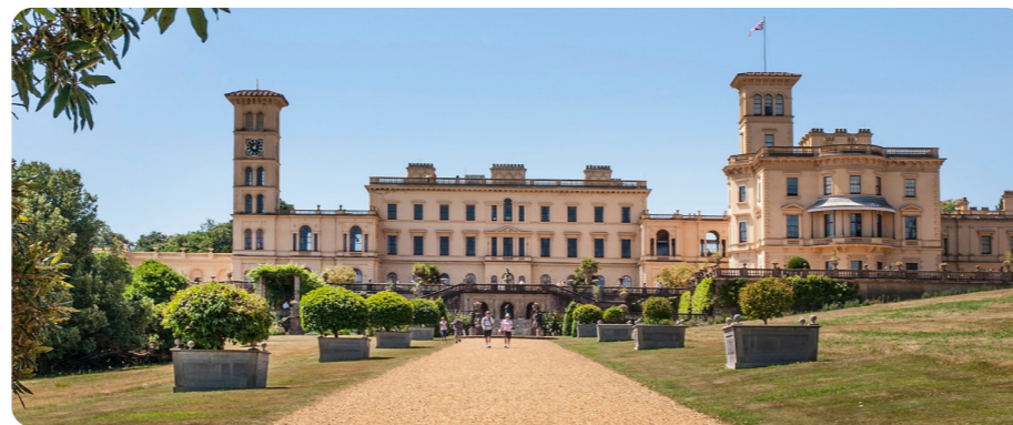
Osborne House is on the Isle of Wight, England. This was Queen Victoria's favourite holiday home.