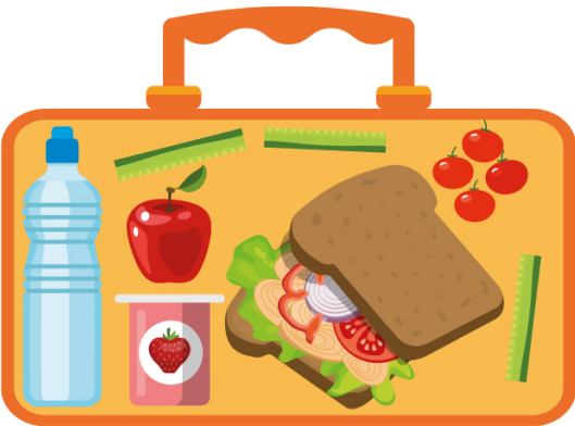
Example of a nutritional packed lunch based on the Eatwell Guide

Choosing nutritional food for a packed lunch can be tricky, especially because processed food and snacks can contain lots of fat and sugar. Choosing a variety of foods from the Eatwell Guide can help to make packed lunches healthier.