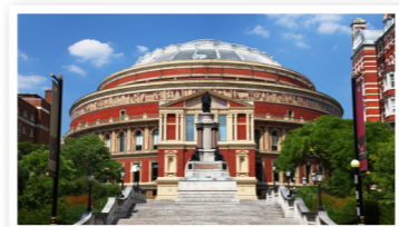
Royal Albert Hall