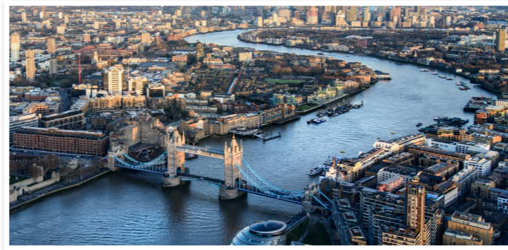
City of London

A city is a large urban settlement with lots of traffic and tall buildings. There are many shops and restaurants to visit there.