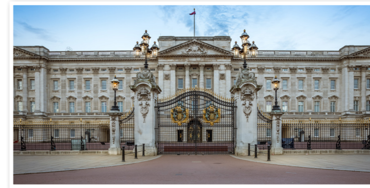
The Queen lives at Buckingham Palace.

Queen Elizabeth II is the current monarch of the United Kingdom. She was born in 1926 and became Queen in 1952. The Queen is famous across the world.