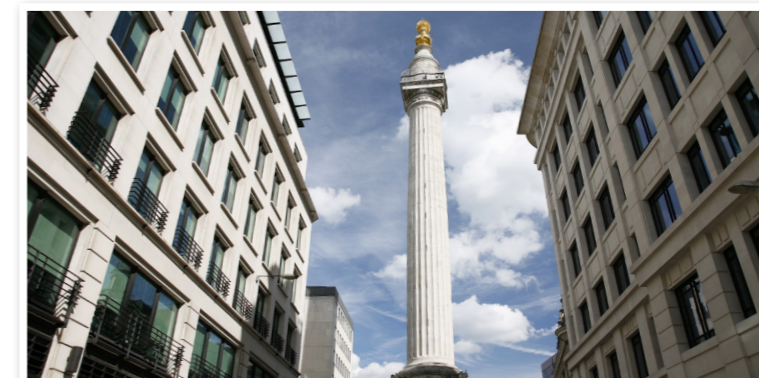
Monument to the Great Fire of London

The Great Fire of London was a significant event in London's history. It began in a bakery on Pudding Lane on Sunday 2nd September, 1666. Many buildings were destroyed including St Paul's cathedral. Today, a monument stands where the fire began.