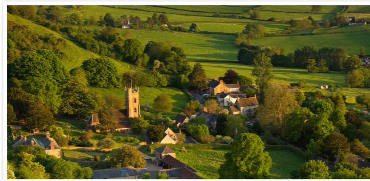
Village of Corton Denham in Somerset

The countryside is a rural area outside of a town or city. Less people live and work in the countryside than in a city.